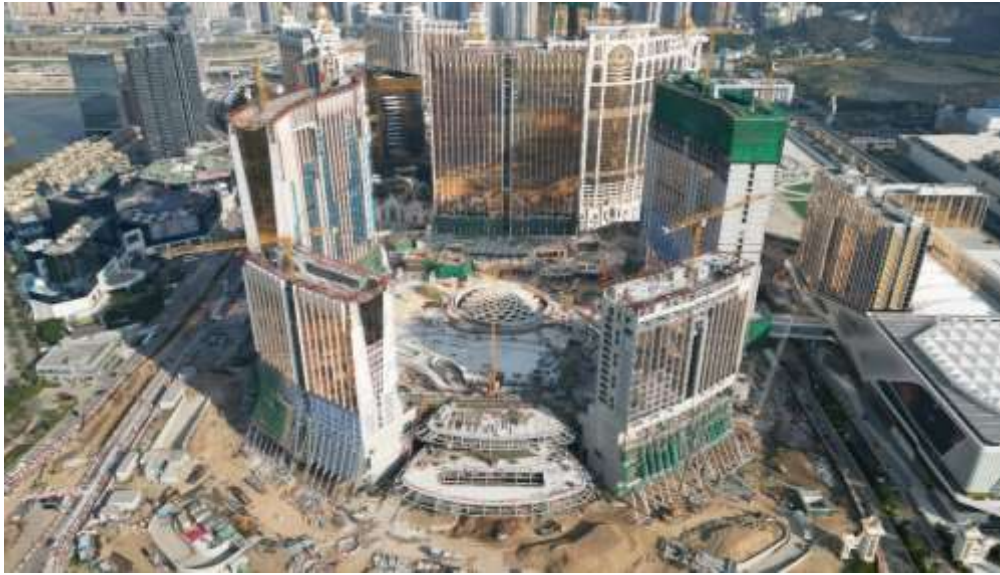
Latest photo of Cotai Phase 4 (January 2024)

4 is approximately 600,000 square meters of development and is scheduled to complete in 2027. We will continue to adjust the development timeline in accordance with the market demand. We remain highly confident about the future of Macau where Phases 3 & 4 will support Macau's vision of becoming a World Centre of Tourism and Leisure.